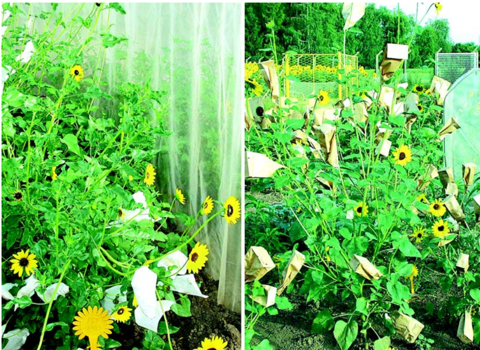
Figure 3: Wild population PET1383 and F_1 hybrid with cultivated sunflower