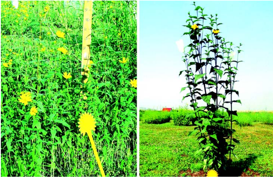
Figure 2: Wild population DIV2085 and F_1 hybrid with cultivated sunflower