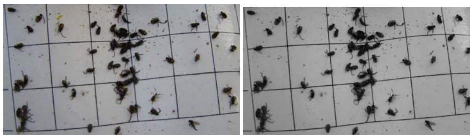
Figure 2. Original (left - a) and image in grayscale mode (right - b) of sticky bases of Diabrotica virgifera sp. virgifera on pheromone trap

The idea was to convert original image (Figure 2) from color to grayscale mode so other color on images or reflection do not have influence on computing area.