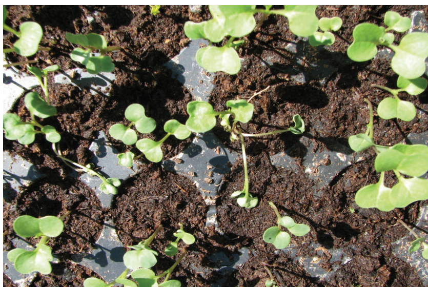
Fig.1. Symptoms in oilseed rape plants originated from seeds inoculated with L. maculans .

Slika 1. Simptomi na biljkama uljane repice kao posledica zaraženosti semena gljivom L. maculans .