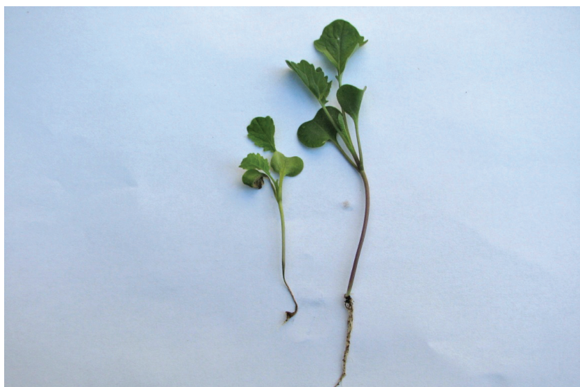
Fig.2. Symptoms on the hypocotyl and cotyledons of rapeseed plants caused from infected seed with L. maculans (left: infected plants, right: healthy plant).

Slika 1. Simptomi na biljkama uljane repice kao posledica zaraženosti semena gljivom L. maculans .