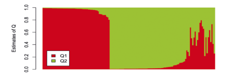
Fig 3 Bar plot of estimated population structure membership of 145 barley accessions. Each accession is represented by a thin vertical segment which is partitioned into K colored segments that represent the individual estimated membership to the K cluster