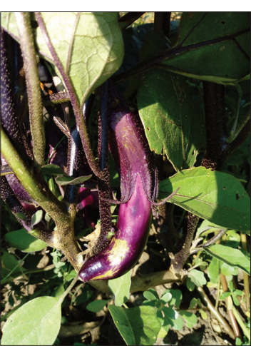
Fig 3. Chinese variety.

Chinese variety (Fig. 3) - Chinese late-ripening variety of eggplant. The fruit is elongated, shiny, dark purple to black. The average weight of the fruit is 228 g;