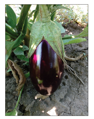
Fig 2. Serbian variety.

Serbian variety (Fig. 2) - Serbian early-ripening variety of eggplant, which belongs to the West Asian subspecies Solanum melongena ssp. occiddentale . The fruit is oval, dark purple to dark blue, weighing 243 g (commercial ripeness);