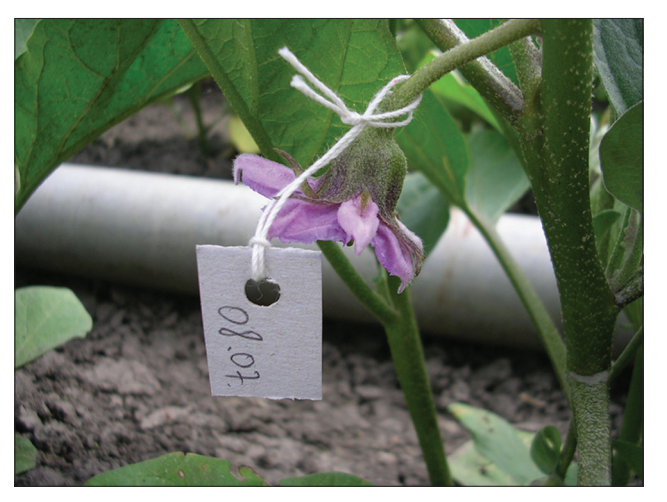
Fig 1. A flower marked by date.

3. Italian variety (Fig. 4) - Italian medium-late ripening variety of eggplant. The fruit is large, long, purple to dark purple. The weight of the fruit is 315 g.