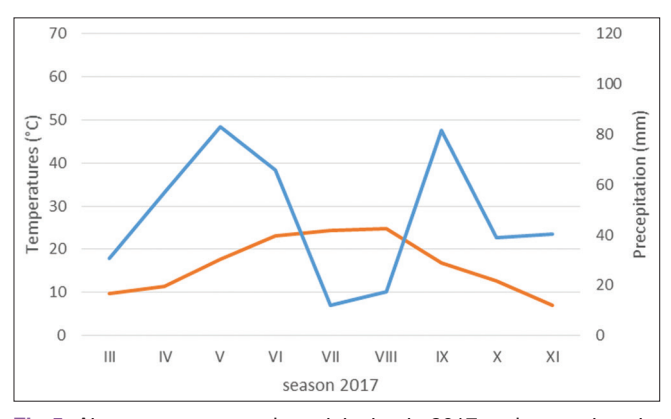
Fig 5. Air temperatures and precipitation in 2017 at the growing site of tested eggplants varieties.