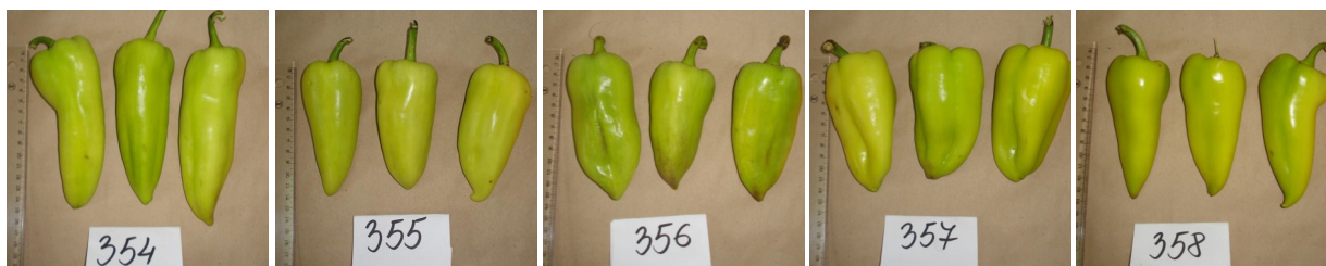
Figure 1. Evaluated pepper genotypes

To determine the degree of relationship between the evaluated traits, researchers usually use a simple correlation analysis (Cankaya & Kayaalp, 2007). In our study we found a positive correlation between fruit weight and pericarp thickness (Table 1). The same results were reported by Lannes et al. (2007) in the species C. chinense . Fruits with thicker pericarp are less susceptible to injuries during postharvest manipulation in transport and selling.